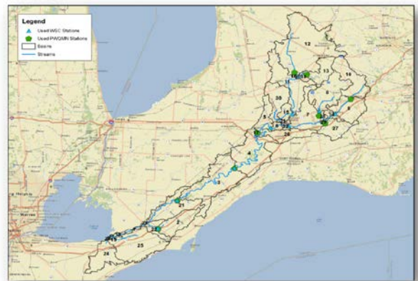
Figure 7-1 Catchment / reach index map with monitoring stations

The Thames River basin is located in Southern Ontario and has a drainage area of 3,432 km 2 . The watershed is home to almost 500,000 people and supports a diverse economy – including, extensive agriculture operations, supporting businesses and other industries. The mixed urban-rural (land use) grid CANWET model provided a means of testing policy options to determine the likely outcome in terms of load reductions and water quality. This approach was used as a means of demonstrating how policy options might be evaluated or applied over the larger Ontario portion of the Lake Erie Basin and to the other Great Lakes, as the Thames River watershed represents only a portion of the overall contributing source area to the Great Lakes.