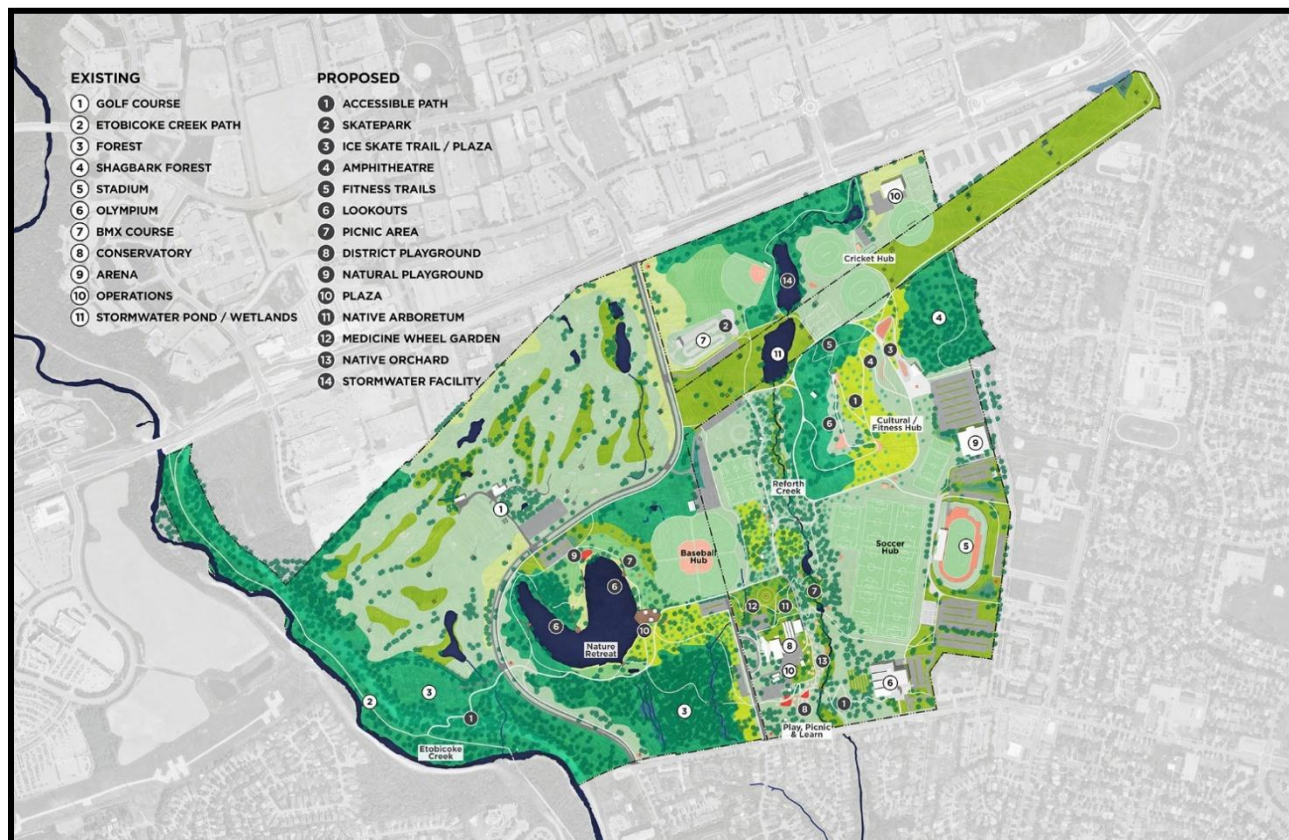
Overall Plan of Centennial Park

Urban Watershed Group Limited joined a team of professionals lead by Cherie Ng Architects to prepare and execute numerous construction contracts necessary to complete the multi phased re-development within the condensed timeframe while also accommodating existing parks programming.